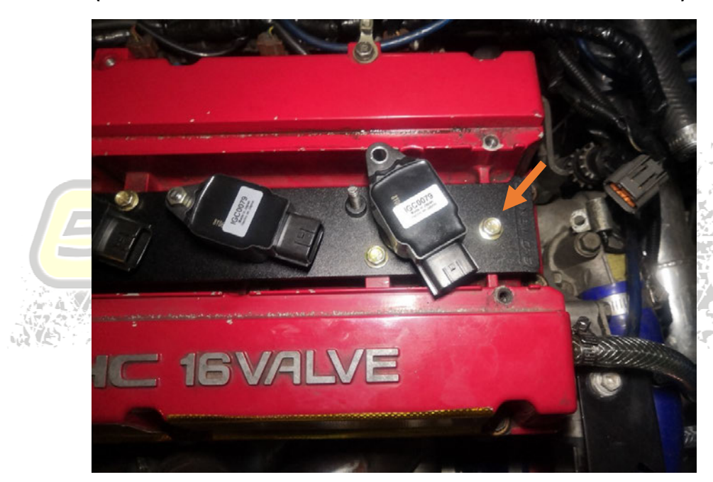
Figure 1 – Fastening the Mounting Plate to The Valve Cover

5. Reposition and tighten 4<sup>th</sup> cylinder coil. Connect the supplied harness as pictured, tuck the main connector onto the provided slot on the mounting plate. Remove the connector bracket as shown.