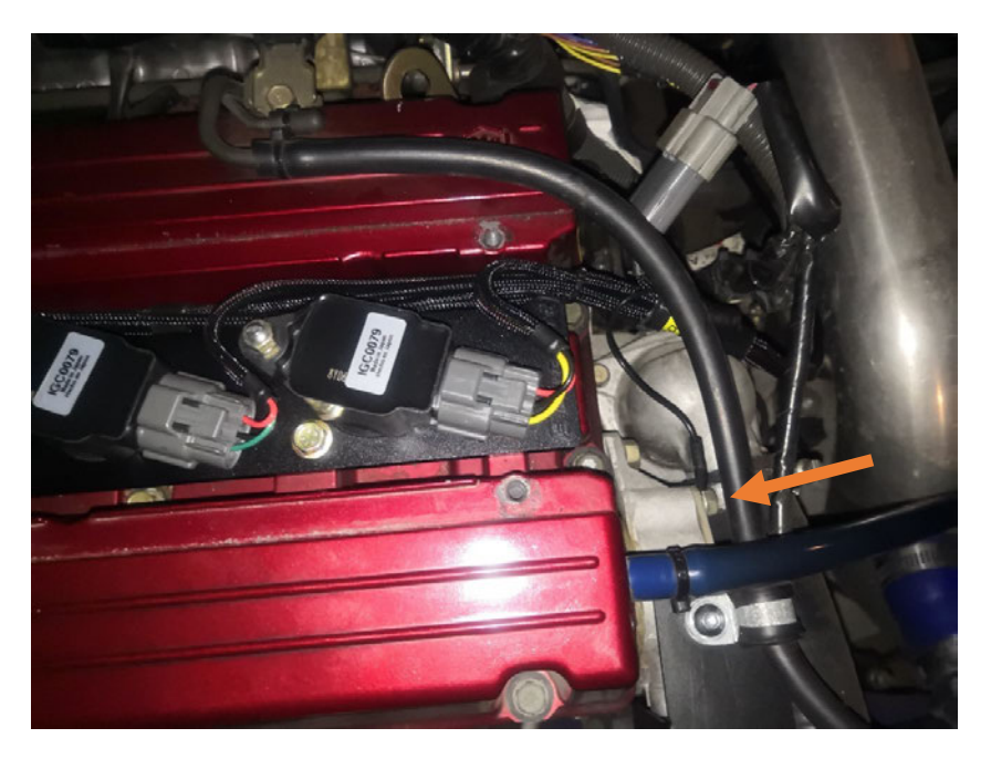
Figure 4 – Attaching the Ground Terminal