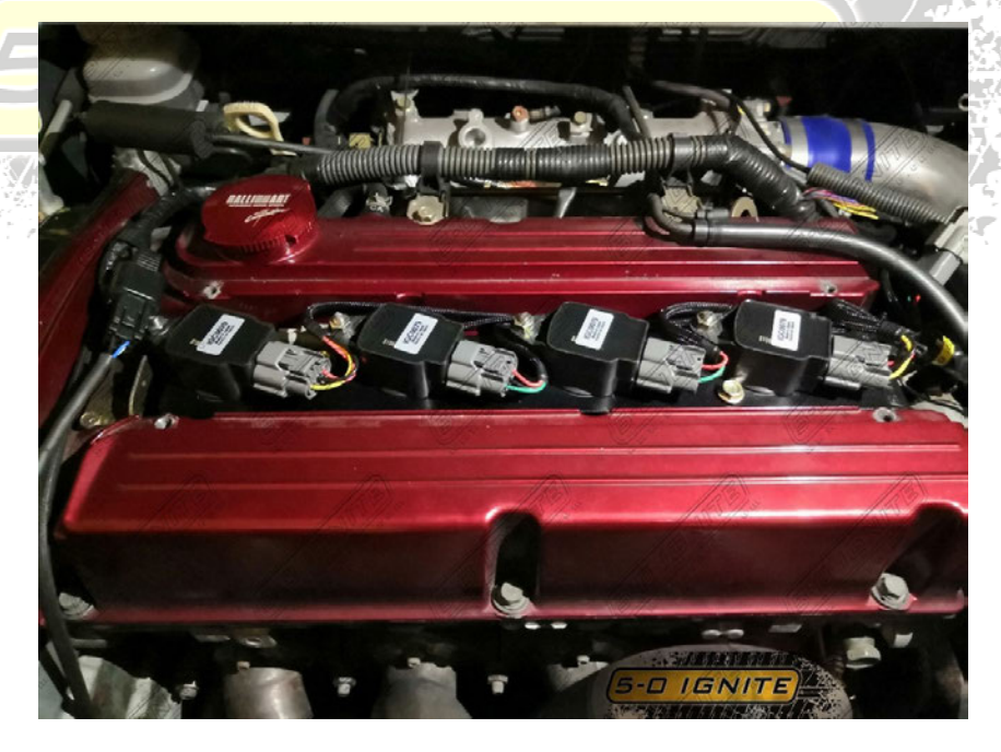
Figure 3 – Routing the Harness

6. Route the individual coil wiring as shown.