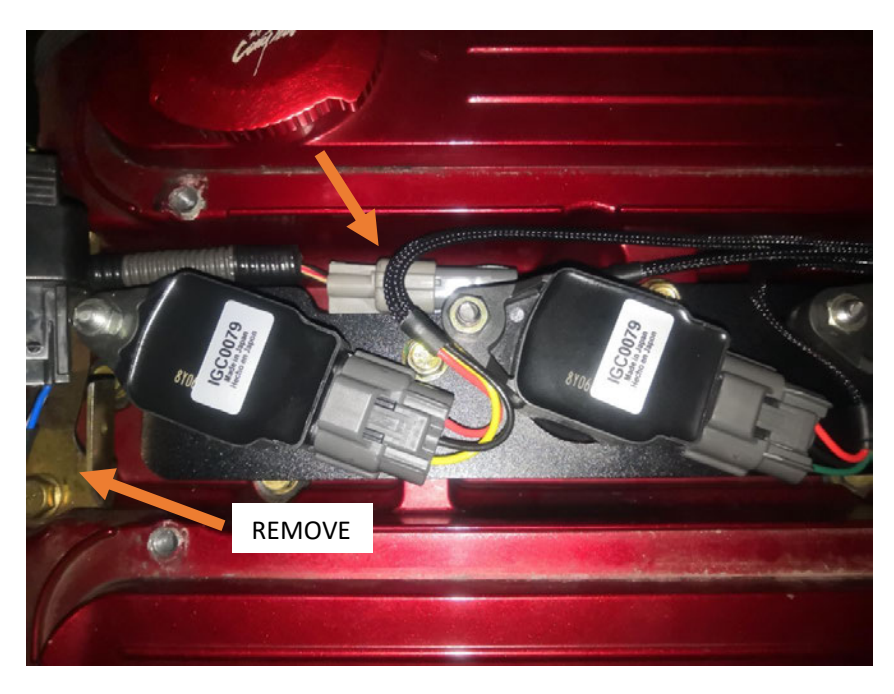
Figure 2 – Tucking the Connector and Removing Bracket

6. Route the individual coil wiring as shown.